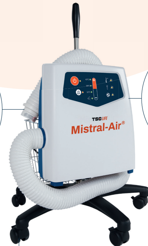
Mistral-Air Warming Unit Art. no. MA1200-EU

With integrated advanced air filtration, you can safely warm your patients with the confidence that 99.95% of particles have been filtered out before reaching the patient. 5